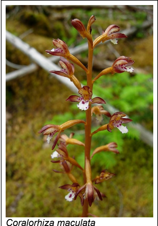
Coralorhiza maculata Heather Saunders