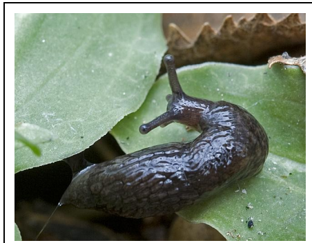
Figure 2: Deroceras laeve on leaves of G. oblongifolia.

Not all inflorescences lasted: of the 8 spikes seen to grow over 4 years, 4