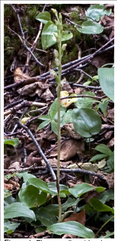
Figure 1: Flower spike at beginning of flowering, 05.08.13

flowers open from below upwards, the last one withering in early September, about four weeks after the first bud opened. The entire spike is dead by the last half of October. The number of flower spikes for this population of 40-50 plants has varied from 0 to 3 each year.