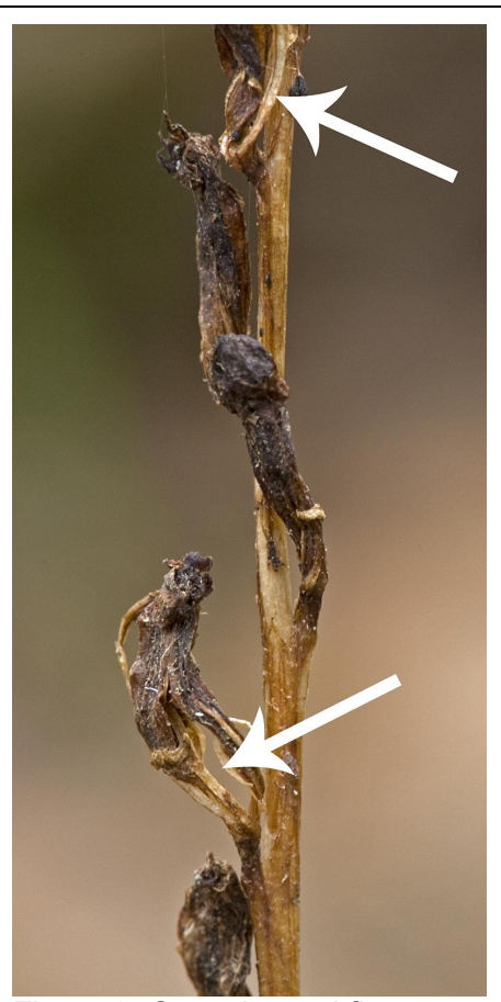
Figure 3: Overwintered flower spike from 2008, photographed 09.05.17. Note two of the thin ovaries have split (arrows), as if they had released seeds.

Up until now, no flower on any of the spikes produced seed. In 2008 there were 3 spikes, 2 of which