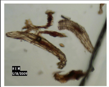
Figure 4: Seeds recovered from 2008 seedpods Two mature seeds (upper R one with tip broken off) and clumped immature seeds.

collapsed, as in past years. However, when examined after snow-melt, May 2009, 2 of the thin seed capsules of one spike had splits, suggesting they may have released some seeds (Figure 3). Henry Mann examined these capsules and recovered clumps of immature seeds and a few mature seeds from them (Figure 4).