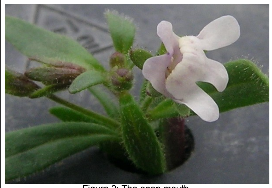
Figure 2: The open mouth.

unbranched or only sparingly branched from leaf axils. Leaves are up to 2.5 cm long, narrow, stalkless, smooth-margined and pubescent. Lower leaves are opposite while the upper ones become alternate. Stems are covered with short glandular sticky hairs.