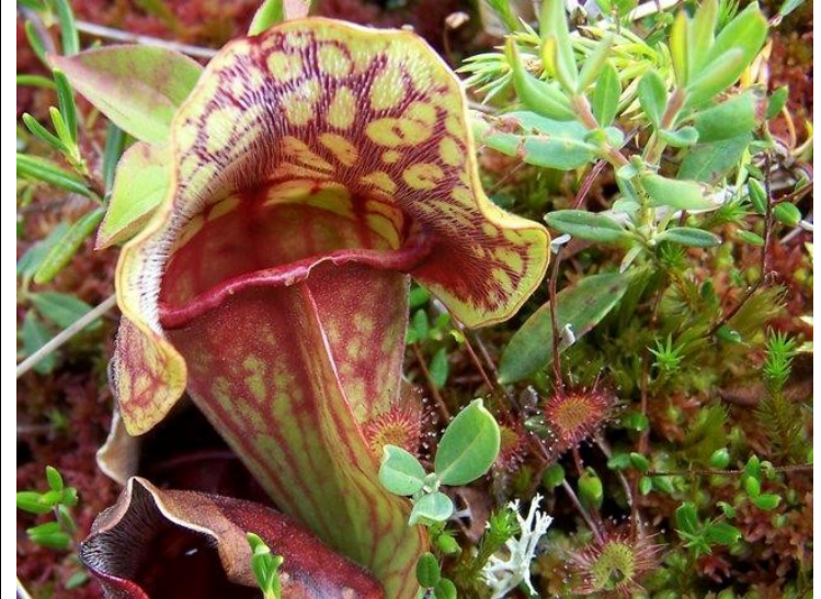
Sarracenia purpurea and other bog plants

Plant-Animal Interactions - 3<sup>rd</sup> - Karen Herzberg