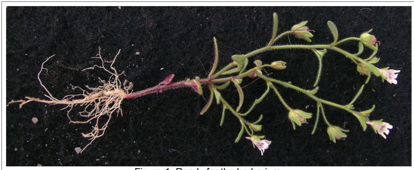
Figure 1: Ready for the herbarium.

This small snapdragon is a "comefrom-away", probably introduced to the Island in relatively recent times. The first occurrence on the Island was reported from a disturbed area around a commercial building in Stephenville in 1997 (Meades et al. 2000). More recently a second population was located at Norris Point in the gravel parking areas around the main wharfs. Specimens from both locations are deposited in the SWGC Herbarium (Fig 1). Because it is a diminutive plant with small flowers inhabiting disturbed places and poor rocky soils, it may have been overlooked by individuals who often pay scant attention such locals and to "insignificant weeds". I suspect it is more common than we are aware. Originally introduced from the Mediterranean region of Europe, it is found throughout Canada and the U.S.A. Being a small annual it is not usually considered a serious weed of gardens and agricultural fields where it can easily be controlled by