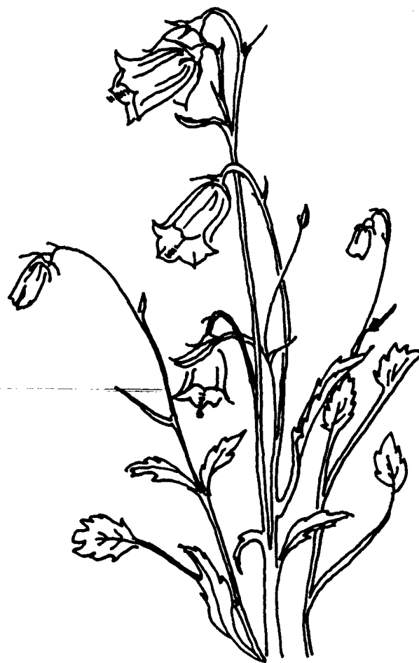
Harebell, (Campanula rotundifolia)