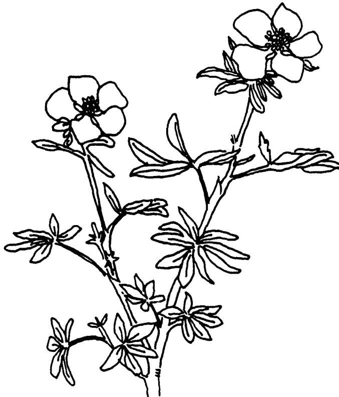
Cinquefoil, (Potentilla sp.)

Each of the four seasons has its own distinctive beauty and materials are therefore always available to work from throughout the year.