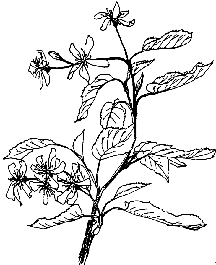
Chuckley Pears Amalanchier sp.

Take a walk on the beach this summer and discover what is there but, please, do not dig for buried treasure under these plants.