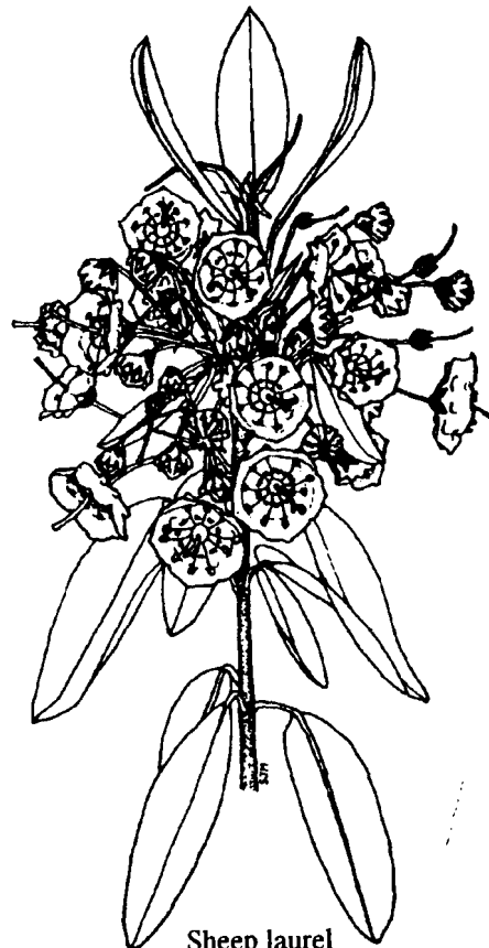
Sheep laurel Kalmia angustifolia

Leaves are either evergreen and leathery (coriaceous), or thin and deciduous. Their arrangement on the stem may be alternate or opposite. Leaf shape varies